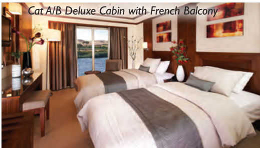
Cat A/B Deluxe Cabin with French Balcony