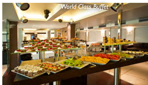
World Class Buffet

IMPORTANT: Please note that as of 25 September 2020 our staff is working from home at reduced hours from 10am-1pm PST. While we are happy to answer any and all questions via phone, whenever possible, please refer to our web site and send us an email which will enable us to handle your inquiries in the most efficient and customer friendly way.