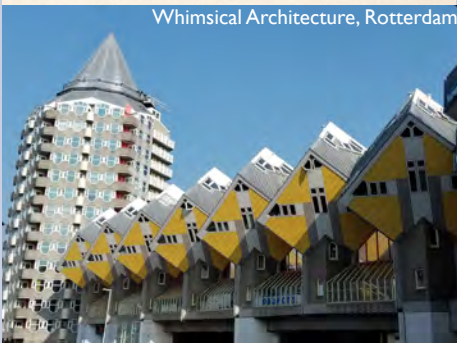
Whimsical Architecture, Rotterdam

Value World Tours, Inc., 17220 Newhope Street #203, Fountain Valley, CA., 92708 @ CST #1000020/10 email: value@valueworldcruises.com • Tel: 800/795-1633 • web: www.valueworldcruises.com